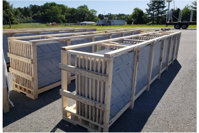
Figure 1: Standard crating of Stainless Arcwall wall panels

Special crating can be arranged with your Metalwërks PM or project engineer. Be sure to mark up your project-specific packaging needs on a set of Metalwërks shop drawings for clarity of communication. See image of a typical crate in Figure 1: