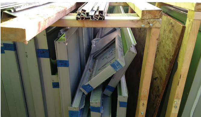
Figure 4: Improper handling of a finished panel. Never leave panel faces unprotected in storage.

When handling the panels, care should be taken so that the finish is not scratched or scuffed. The daily use of clean cotton gloves is recommended and when handling stainless steel panels, Tyvek® protective gloves are recommended. Panels should be carried with the attachment legs oriented skyward in the same manner as they were crated. A handling plan should be discussed with your Metalwörks representative for some of the more fragile, shaped panels. Many panels can be damaged or racked out of tolerance when subjected to careless handling.