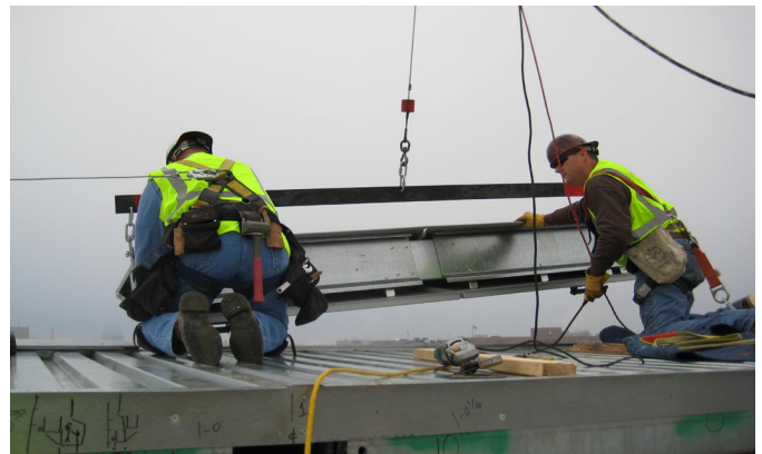
Figure 6: Unitized cornice assembly: Hoisted using wire slings slung through unfinished framing sections inside the unit.