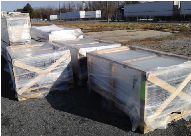
Figure 2: Panels prior to loading on a flatbed- crated with shrink wrap protection prior to covering with tarps.

Note: Any damage and/or shortages must be reported in writing within 24 hours of receipt of shipment. For additional information, see the Metalwërks Terms and Conditions.