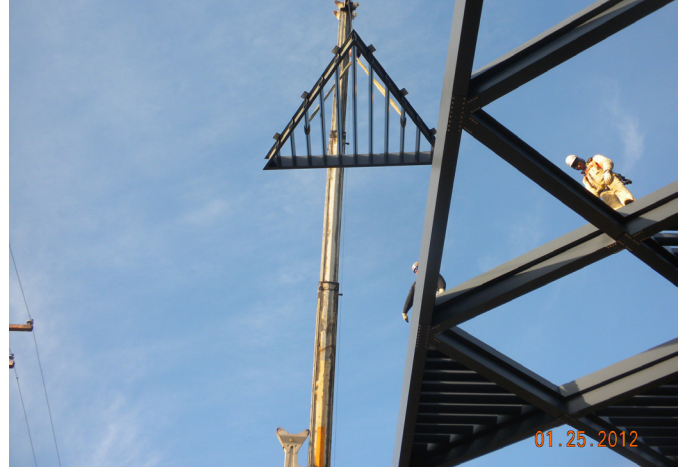
Figure 5: Large triangular shaped sunshade assembly is hoisted into place.

Large assemblies can be produced in a unitized fashion. These assemblies can be hoisted and placed by crane. Note: Nylon slings are used to avoid damaging the finish. This method is discussed in more detail in Section 9: Unitization.