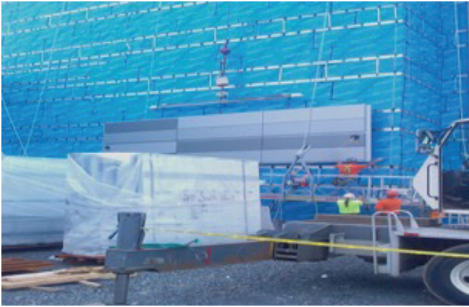
Figure 3: Metalwörks crated wall panels- properly stored awaiting installation